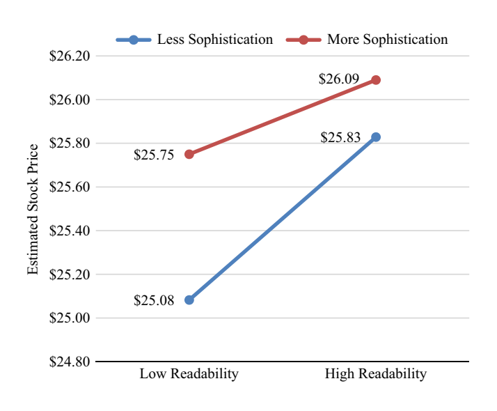
Figure 1. Equity valuation by readability and sophistication level

plain English requirements. Of critical note in the results is the similarity between less-sophisticated NPIs using plain English disclosures and more-sophisticated NPIs using less-readable disclosures. A t-test performed between these two groups finds no significant difference between their mean equity valuations ($25.83 vs $25.75, respectively, t=0.27, p=0.79, not tabulated). This suggests that an increase in