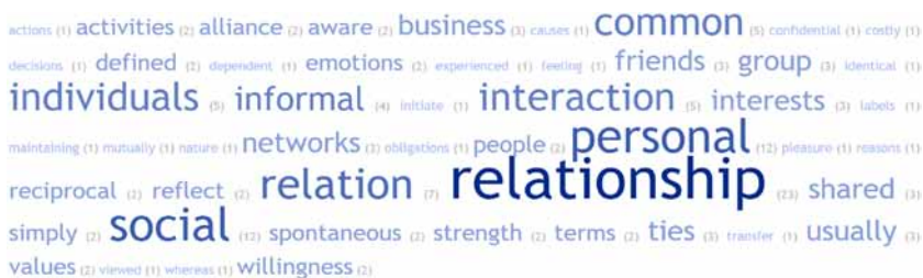
Fig. 4.1. Analysis of Social Relationships Definitions.

Our next RQ identified 10 building blocks (see Table 4.3) for SR, with trust being the dominant one as it was identified in 16 papers in our literature review.