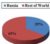
Figure 2. European imports of natural gas from Russia/2016

On the other hand, the projects of British Petroleum Company are also concentrated on the North Damietta concession area, where the company discovered three gas fields. The first field was Salamat Field. On September 9, 2013, British Petroleum Company announced