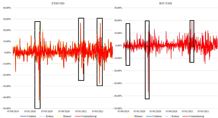
Figure 1. ETH/USD and BTC- USD daily returns

The results also suggest that there may be a divergent behavior of the CoinMarketCap databases in relation to Binance, to a greater degree, and Coinbase and Kraken, to a lesser degree, given the small difference found in the estimates of ADF and KPSS tests. However, although the ADF and KPSS tests indicate stationarity, nothing can be said about cross information between databases or about cryptocurrencies. This is important as information from the past value of one time series could be used to predict the behavior of other time series. This assessment is made in the next section.