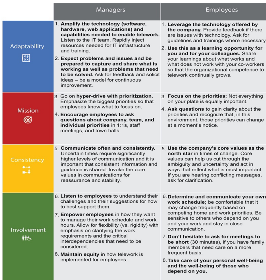
Figure 2. Adkins and Kaur (2020)

To help conceptualize this recommendation, Figure 2 illustrates how the CEO and employees of Phoenix Rising may positively leverage the unique and newfound realities of