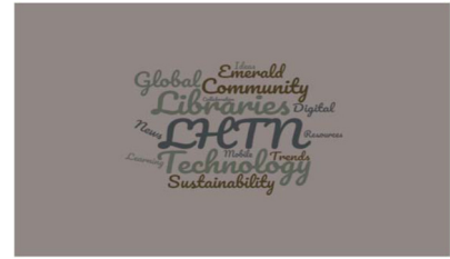
Figure 2. LHTN Word Cloud

appropriate uses of technology (maybe often not the newest but being used in imaginative and innovative ways) for community engagement, no matter what the community might be in the world. LHTN articles continue to have many more downloads each year ever since I became the editor. More than most library and information technology media, LHTN has a very wide geographic readership. Now, with article-level publishing (see www.emeraldgroupublishing.com/authors/index.htm and www.emeraldgroupublishing.com/authors/editing_service/pdf/alp.pdf ), we are getting our edited articles out to the community as soon as possible as being published online with a unique DOI that can be cited just as if they were published in print. No longer does an author have to state that their articles are in press or accepted. The articles will appear in print at a later date and for some will be part of their historical record but in other parts of the world without good online access, will still be quite relevant and timely (Figure 2).