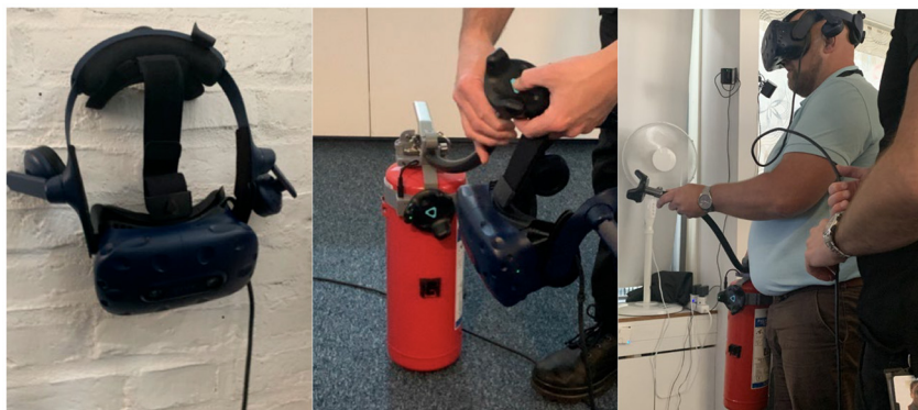
Figure 2. IVR equipment for immersive fire safety training

As depicted in Table 2 , this study used three distinct methods for collection of primary data, including 10 semistructured interviews with train operators at SJ, a Web survey that