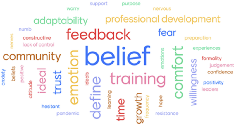
Figure A1. Interview codes by frequency