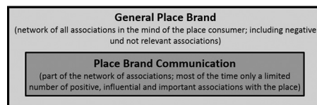
Figure 1. Difference between place brand and place brand communication

Obviously, brand management deals with the managerial part of branding – thus focusing on the place brand communication , keeping the general place brand in mind and the communicated brand in alignment. For a more complex brand management model, brand architecture (Aaker, 2004) is often used, showing hierarchical structures of brands (in the corporate context) with different strategies for multiple target groups. With the branded house approach, a brand architecture is built with related and more focused sub-brands for each product that are marked within the corporate umbrella brand (Petromilli et al. , 2002). The aim is to build a strong overall company umbrella brand with the help of the target group-specific product sub-brands (e.g. “Nivea” as umbrella brand and “Nivea for men” as target group-specific sub-brand focus). This approach is not limited to product and company brands. It could also be extended to product or company brands that include a place brand (Uggla, 2006), or fully to the place branding context (Iversen and Hem, 2008; Kotler and Gertner, 2002). In contrast to our colleagues, we are not using the brand architecture in the