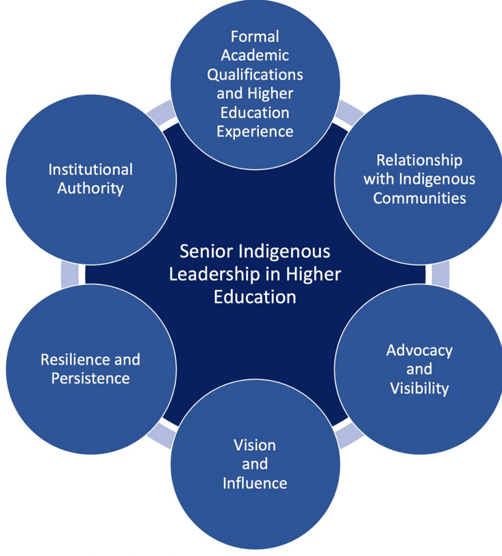
Figure 2. Essential components of senior Indigenous leadership in Australian higher education from the perspectives of Indigenous academics