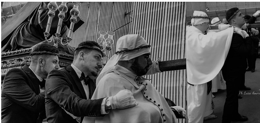
Plate 3. Confrere while carrying “La Cascata” simulacrum in procession embrace each other sharing emotions

During the pilgrimage, some members wearing black suits—the so-called “forcelle”—support the other members in sustaining the simulacra. This name derives from the crutches (in the local dialect “forcella”) they use in holding up the simulacra are situated on the