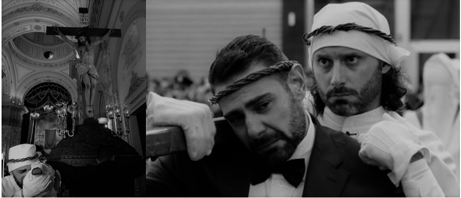
Plate 5. Different sacred vestments of the two main Confraternities: Addolorata (on the left) and Carmine (on the right)

Plate 4. Emotional involvement in the rites