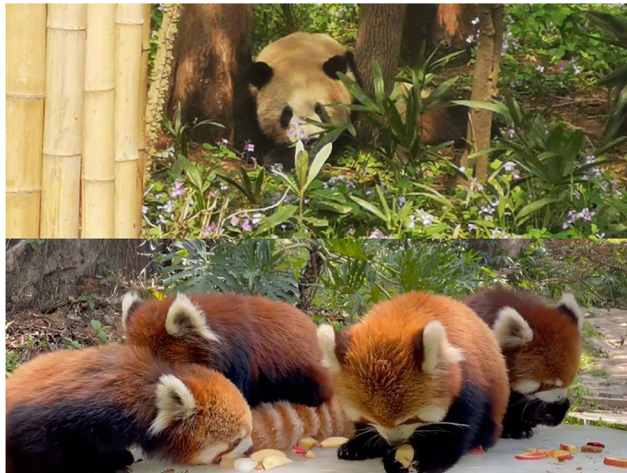
Figure 3 Adorable animals in Shanghai and Guangzhou Zoological Parks