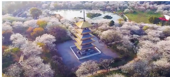
Figure 2 Online enjoyment of cherry blossom

The technology utilization into tourism recovery was also stressed by local tourism administrations and tourist attractions. The Palace Museum (Beijing) introduced one exhibition App, where a virtual reality panorama of the treasure collections in the museum was opened to the customers (Table 2, No. 6). Olympic Museum (Beijing), Hubei Museum (Wuhan), Shanghai Museum and Guangdong Museum (Guangzhou) used the intelligent audio explanation and guide services to replace manual guides and prevent physical contact (Table 2, No. 7). Moreover, Beijing Municipal Bureau of Culture and Tourism established the smart ticketing platform for the municipal park management, with online reservation services and big data analyses of customer profiles, to improve the smartness and safety of local park visits (Table 2, No. 8). Guangzhou Municipal Bureau of Culture and Tourism paid special attention to the integration of high-tech including new media and artificial