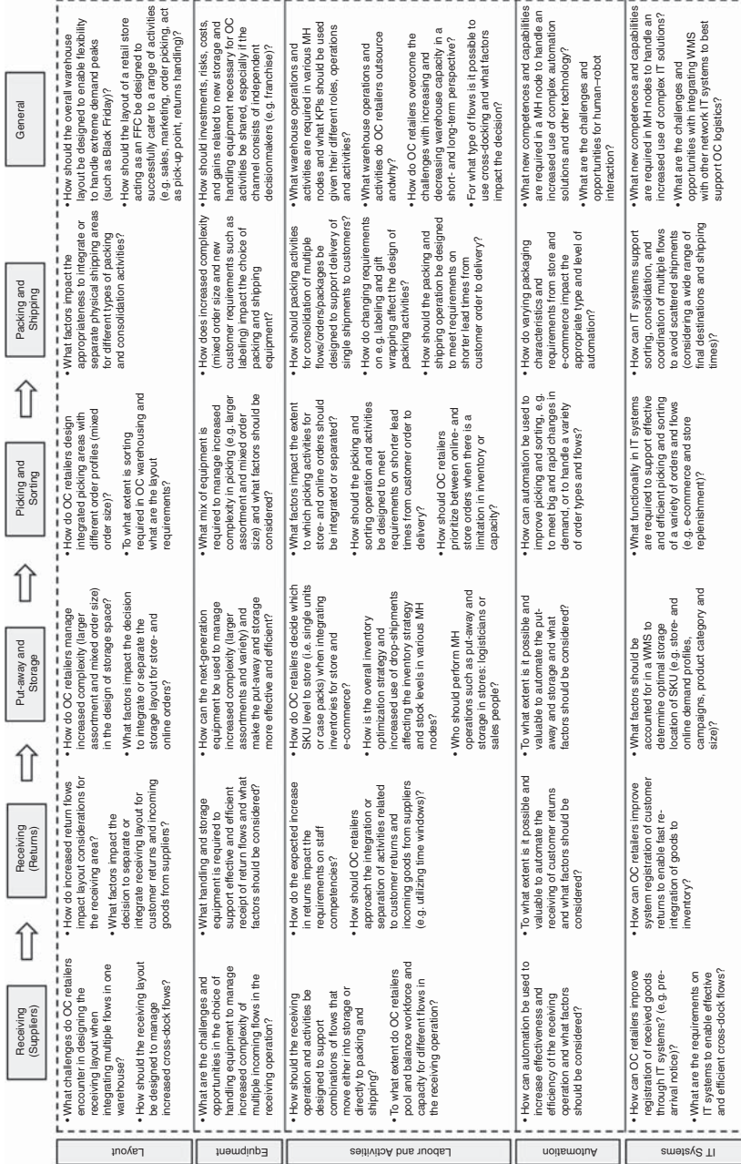
Notes: Omni-channel, OC; material handling, MH; key performance indicator, KPI