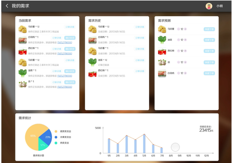
Figure 3. Supply information page (individual)