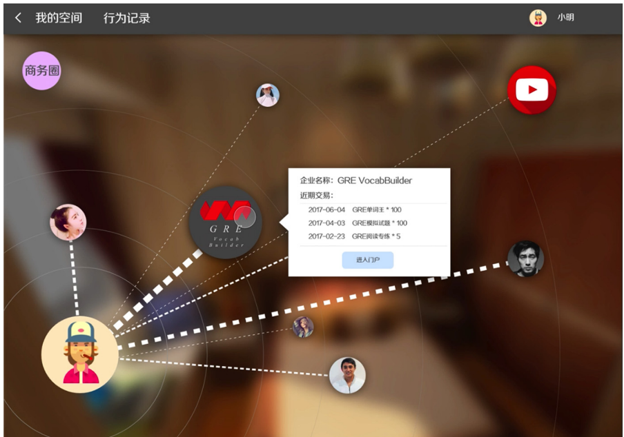
Figure 4. Space information page (individual)