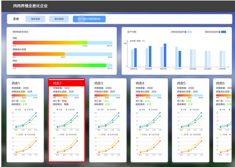
Figure 5. Production process management page (enterprise)