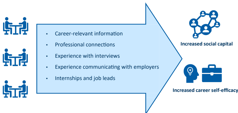
Figure 2. Mechanisms through which event-based engagement with employers was seen to support students' employability

This study also provides naturalistic descriptions of social capital at work, illustrating the way in which social capital builds self-efficacy and supports individuals to achieve their career goals. Social capital is reflected in the number and depth of relationships between people but it creates value because these relationships connect the relevant individuals with information and opportunities (Coleman, 1988). Most social capital research relies on survey data which measures the number and quality of social connections that individuals have and relates these to various career outcomes (Gubbins and Garavan, 2016; Lin and Huang, 2005; e.g., Seibert et al. , 2001). In this study, we asked students what steps they could take to achieve their career goals, comparing their responses before and after the event. By adopting this approach, we were able to obtain examples of the ways in which new social connections provided students with information and opportunities that they could use to advance their career goals. The study therefore illustrates the mechanisms through which shallow ties developed from a well-structured event can support career outcomes. Based on students' descriptions of the event process and its outcomes, we propose a model of the mechanisms through which structured, event-based engagement with employers can support students' employability (see Figure 2).