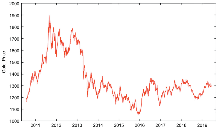
Figure 3. Gold price for the period 19 July 2010–11 April 2019