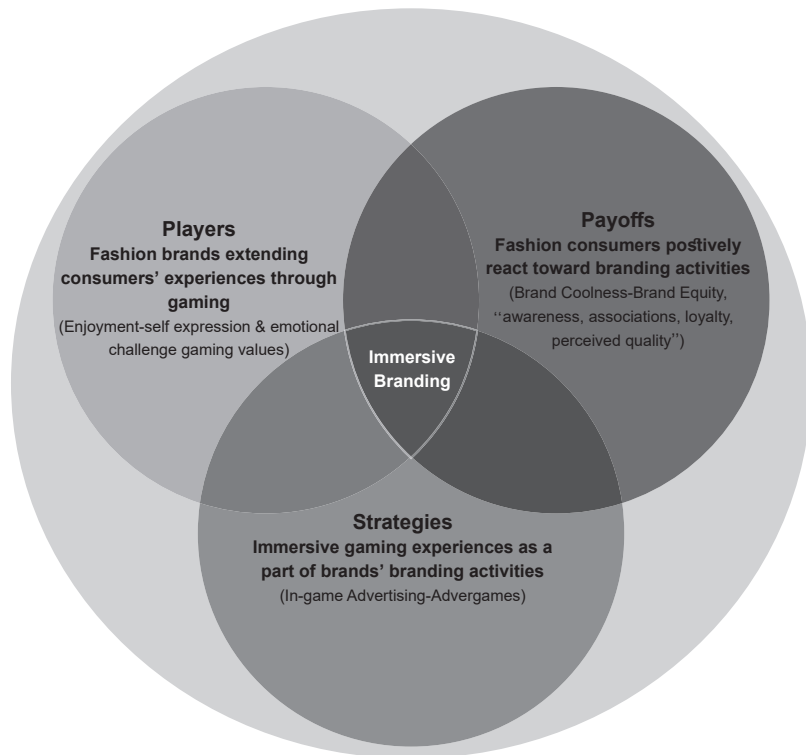
Figure 1. Game theory framework