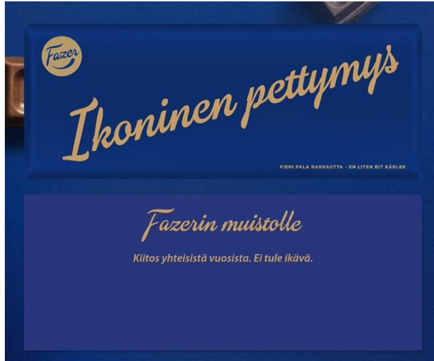
Figure 3. Screenshot posted on Twitter of the campaign's service that allowed customers to design their own Fazer Blue wraps

Notes: Translation: “Iconic disappointment. To the memory of Fazer. Thank you for our years together. You won’t be missed”