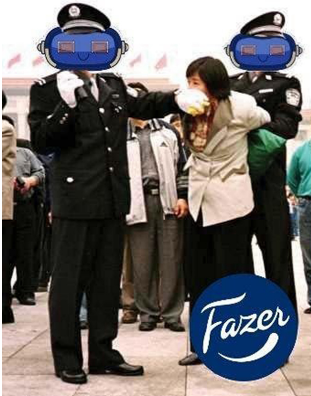
Notes: The blue robot faces are taken from the campaign mascot