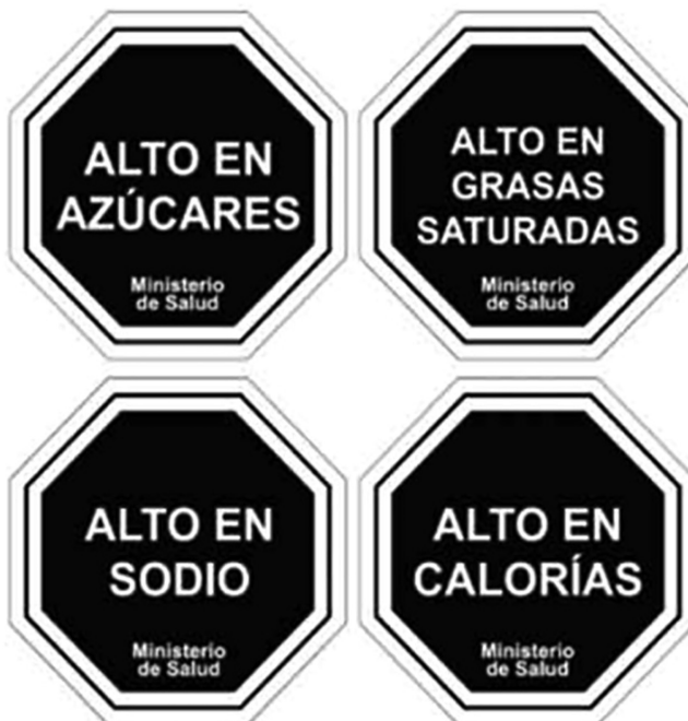
Figure 1. Front warning seal models approved in Chile (Minsal, 2015)

The review was developed following the guidelines established by Preferred Reporting Items for Systematic Reviews and Meta-Analyses extension for Scoping Reviews (PRISMA-ScR) (Table S1). The end of the implementation of the law is recent. Thus, a scoping review was chosen because the purpose was to map the available evidence and to provide an overview of this topic. Besides that, scoping reviews are exploratory and descriptive in