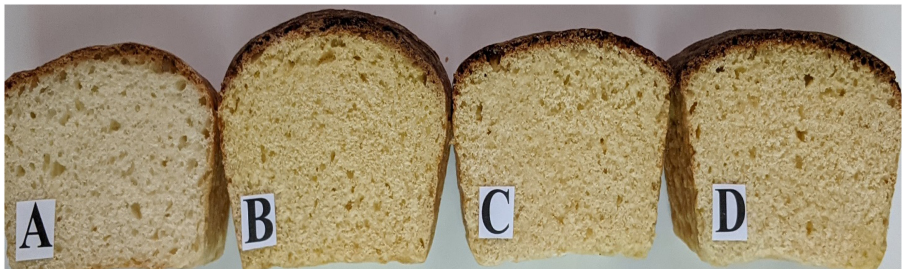
Figure 3. Crumb color and crumb grain of white wheat flour (WWF): chickpea flour (CF) breads

The WWF, WGF and their blends were made into dough using Farinograph water absorption and the results of TPA are presented in Tables 5 and 6, respectively. The hardness values differed significantly when WWF was replaced with different levels of CF (Table 5). The decreased hardness value may be due to the dilution of wheat gluten by the CF proteins