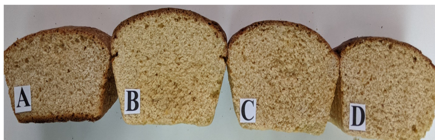
Figure 2. Crumb color and crumb grain of wholegrain wheat flour (WGF): chickpea flour (CF) breads

Key: A = WGF control (100:0), B = WGF:CF 80:20, C = WGF:CF 70:30, D = WGF:CF 60:40