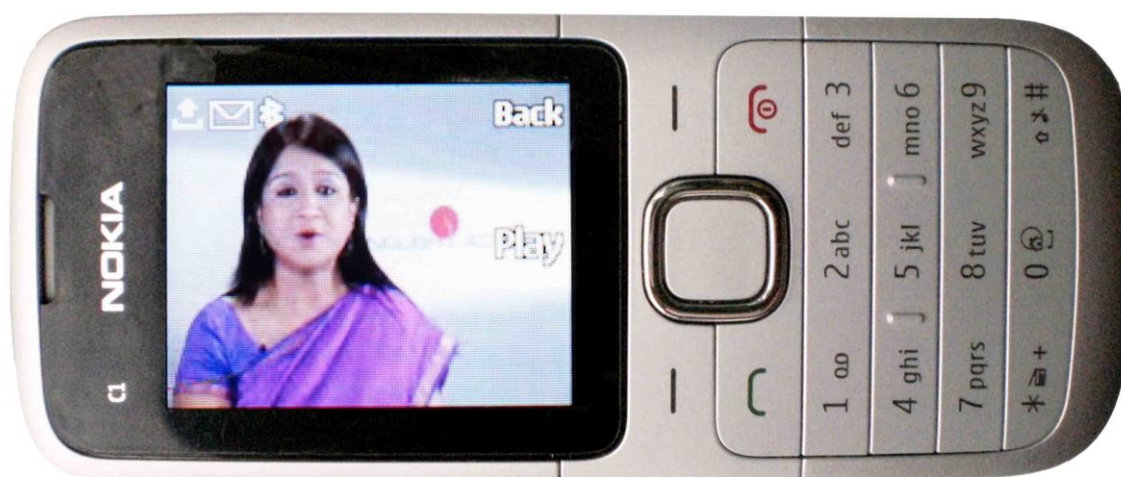
Figure 8 EIA’s narrator presenting the TPD through a MAV

Each of the MAVs starts with a female narrator, who is the ‘expert’ voice, introducing each TPD focus of the module. What makes EIA’s MAV resources for TPD innovative is that the narrator first sets a ‘viewing task’ prior to the teachers watching the video and then poses reflective questions for them to consider and respond to after practising similar techniques in their own classrooms. The expert voice of the narrator enables EIA to move away from the default cascade model of large-scale professional development where information is passed down from the original author, through a range of master trainers, eventually reaching the teacher in an often ‘diluted’ form (Robbins & Latchem, 2003).