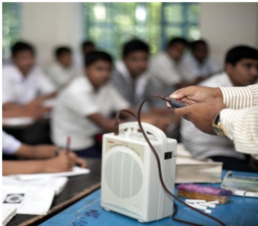
Figure 7 EIA’s mobile-phone-based technology kit known as ‘the trainer in your pocket’

classroom audio resources on 4 GB micro SD cards (£2). The kit has affectionately become known as the ‘trainer in your pocket’