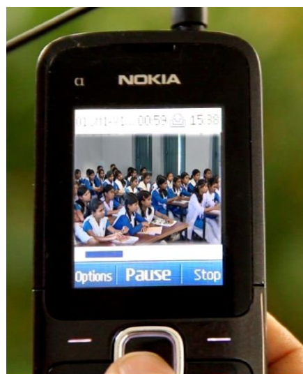
Figure 10 Students engaging in communicative English

Afterwards, the narrator comes back on and says: