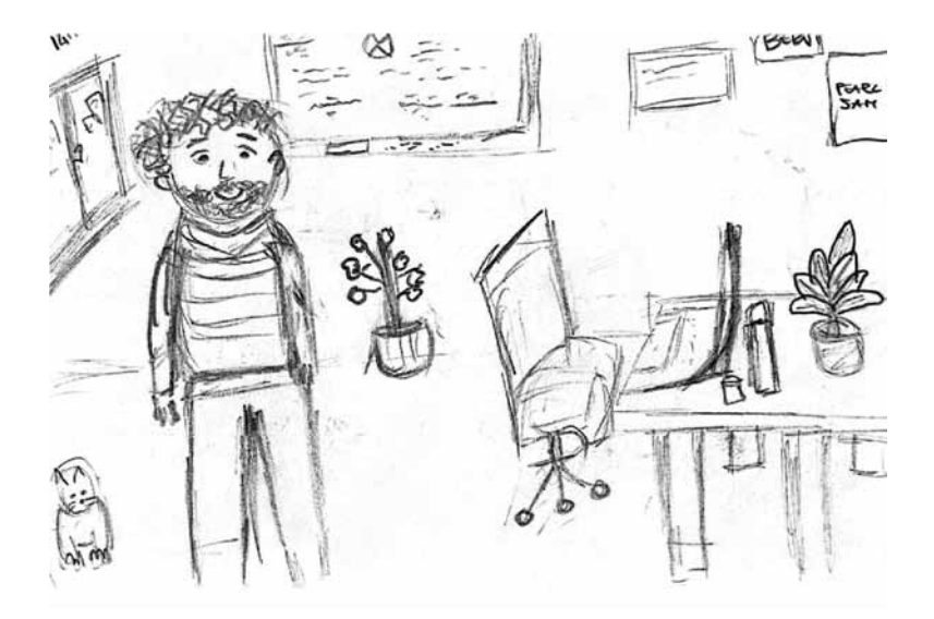
Fig. II. The Person Who Supported Me the Most.

And, as is expected in most publications, I thank the person who supported me the most (Fig. II).