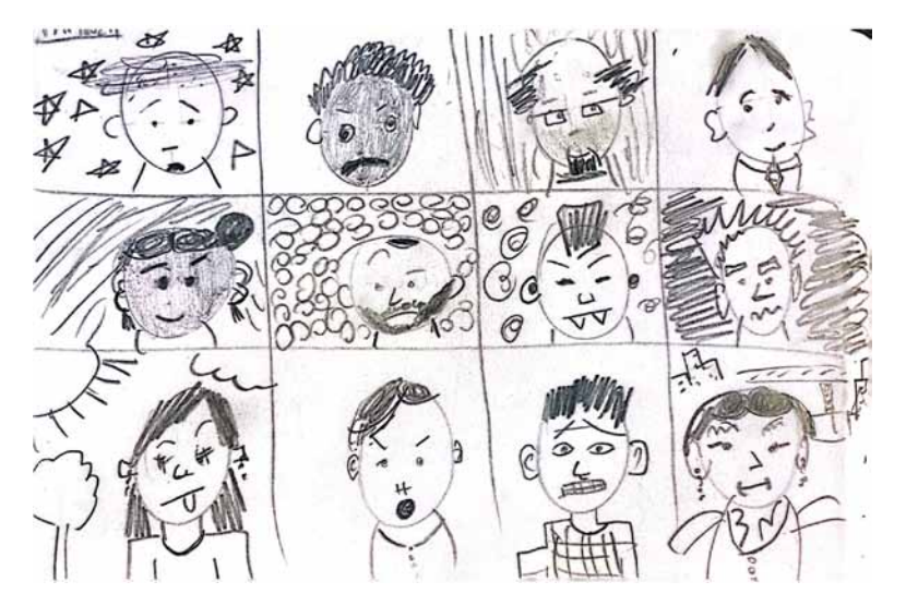
Fig. III. Hypothetical Readers.

And these are the hypothetical readers (Fig. III) I want to thank in advance for joining me on this venture!