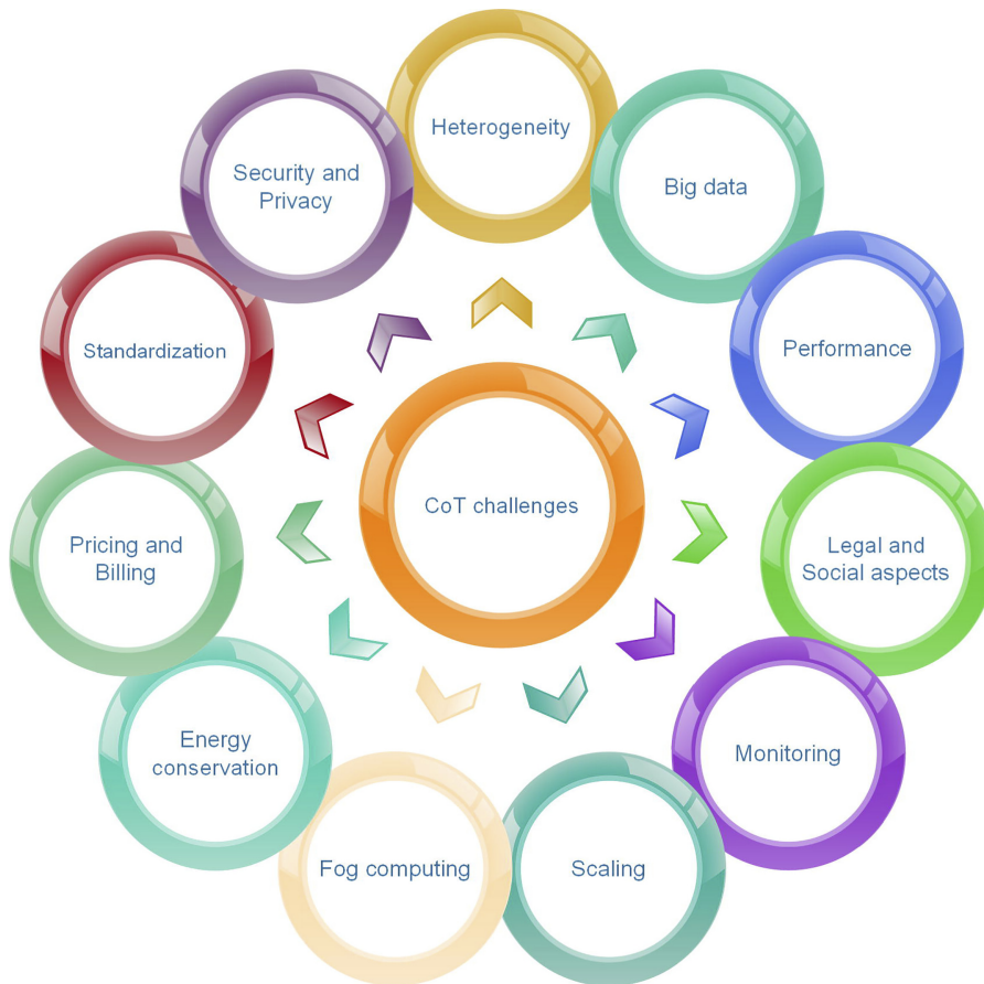
Figure 3. CoT challenges.