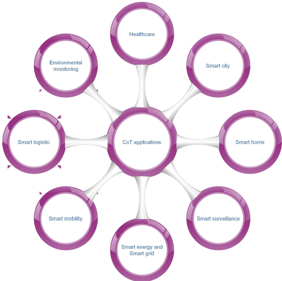
Figure 2. Applications of CoT.

load balancing, security and privacy. Some of these requirements can be provided by the infrastructures of CC. Therefore, common issues and challenges are related to privacy and security reliability, heterogeneity, scale, resilience, and real-time interactions.