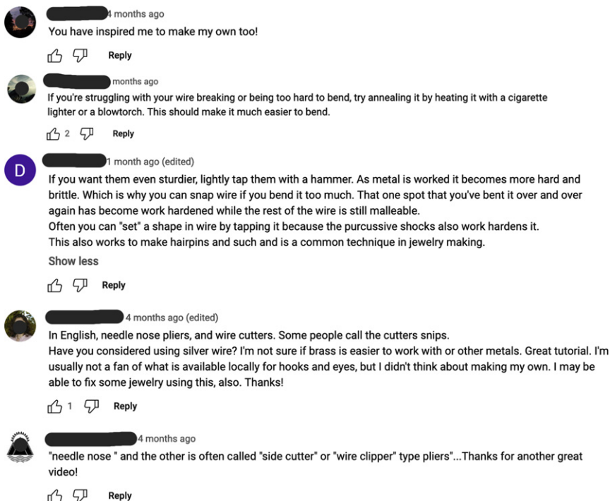
Fig. 2. Lively Exchange for 'How to Make Your Own Hooks and Eyes'. 42

imagine alternative ways of living, things we also would like to do. By following in their steps, imitatio , we learn the basic elements of a craft or process, aiming for an ideal superatio moment where we obtain a deeper understanding of the genre at hand and are able to formulate our own principles and juggle with the different ways of doing things. Then, perhaps, we are ready to make our own videos to share; ones worthy of being imitated.