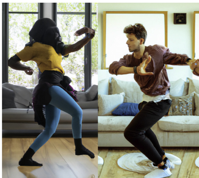
Fig. 3. A TikTok Duet Dance Challenge, Reimagined by DALL-E and me.

the platform that explains how this mode of consumption translates into imitative activities in people's life. 52